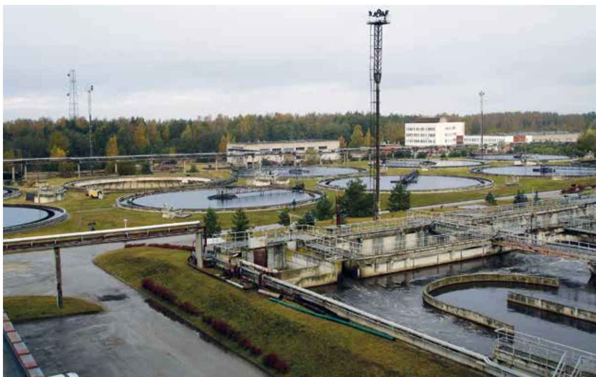
Riga Daugavriga sewage treatment plant, the pilot investment site of PURE project.

Local authorities and water administrations should introduce programmes to restrict emissions of hazardous substances to municipal wastewater systems. Since urban run-off is a highly relevant source for some substances, it is recommended that an overview of the urban run-off emissions is elaborated and, if necessary, sufficient control and treatment implemented on a local or regional level.