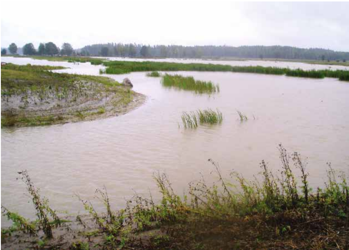
Farmers can take care of the water management i.e. by building wetlands. Here is the Rantamo-Seitteli wetland in Finland.

As many farmers have a lack of trust in water authorities, knowledgeable people from the farm advisory sector can act as facilitators. In addition, validation and communication of alternative solutions can be an important task for farm advisors in improving the uptake of sustainable innovations for the management of farm business.