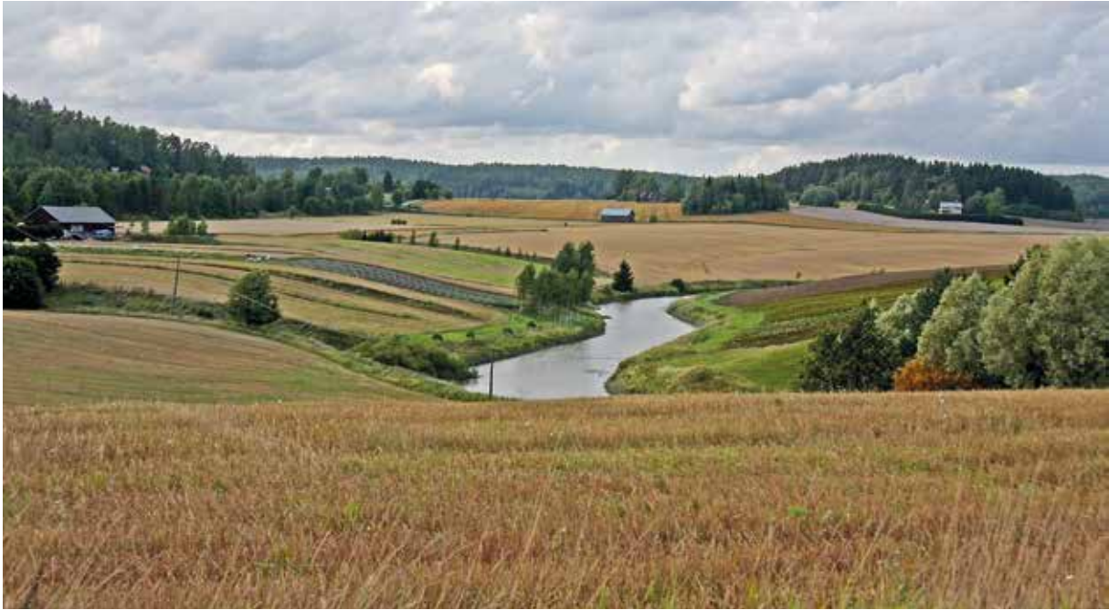
This peaceful landscape can produce biomass like food and fodder, but also other ecosystem services like increase in biodiversity and recreational opportunities.