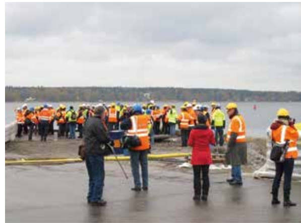
SMOCS project developed participatory approach for the management of contaminated sediments. Here is an information meeting for stakeholders in Gävle Port, Sweden.

The overall aim is to find a shared interpretation of the sustainability concept in the Baltic Sea region for the problem in question; i.e. to identify important environmental, economic and social criteria for management of contaminated sediments.