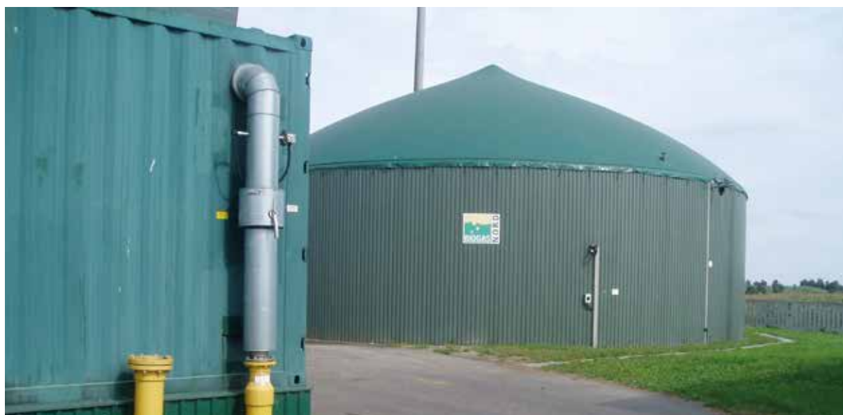
Baltic Compass visited a biogas plant in connection with a big scale piggery in Brest, Belarus.

Anaerobic digestion producing biogas is based on a variety of substances. At the European level, a substantial part