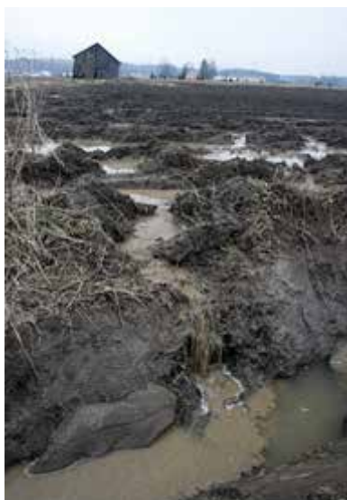
Sediment and nutrient leaching from a high risk field.

The P-index is often considered to be a cost-effective tool to reduce P leaching. This empirical model emphasizes different risk parameters to form a combined risk factor number, which can be used as a guiding factor when selecting practices and policies that reduce P leaching both at a field and catchment level. The major challenges include lack of data such as soil P status.