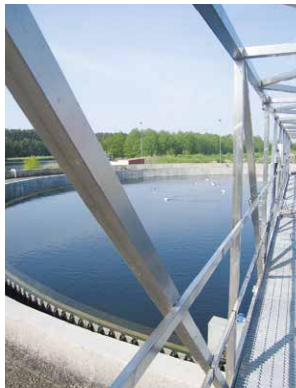
Jurmala wastewater treatment plant in Latvia.

Despite the fact that the importance of sufficient treatment has been recognised, there are challenges. Harmonizing the regulatory framework should be one of the objectives in this field. In several countries, including Belarus, municipal wastewater treatment plants are responsible for treating industrial wastewaters, while, at the same time, for example in the northern parts of the region, industry is responsible for the quality of their wastewaters. More importantly, countries see the validity of the HELCOM recommendations