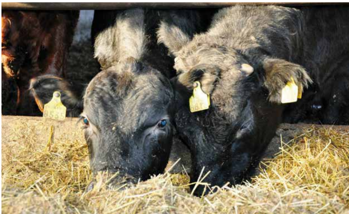
Ruminants can digest plant-based food as no-one else can. However, animal diet need to be adjusted as surplus intake of N and P just leads to high N and P content in manure.

Adopting phase feeding for livestock means grouping of livestock on the basis of their feed requirements allowing a more precise formulation of individual rations. This increases the animal's nutrient use efficiency and results in reduced excretion of nitrogen and phosphorus in animal faeces and urine.