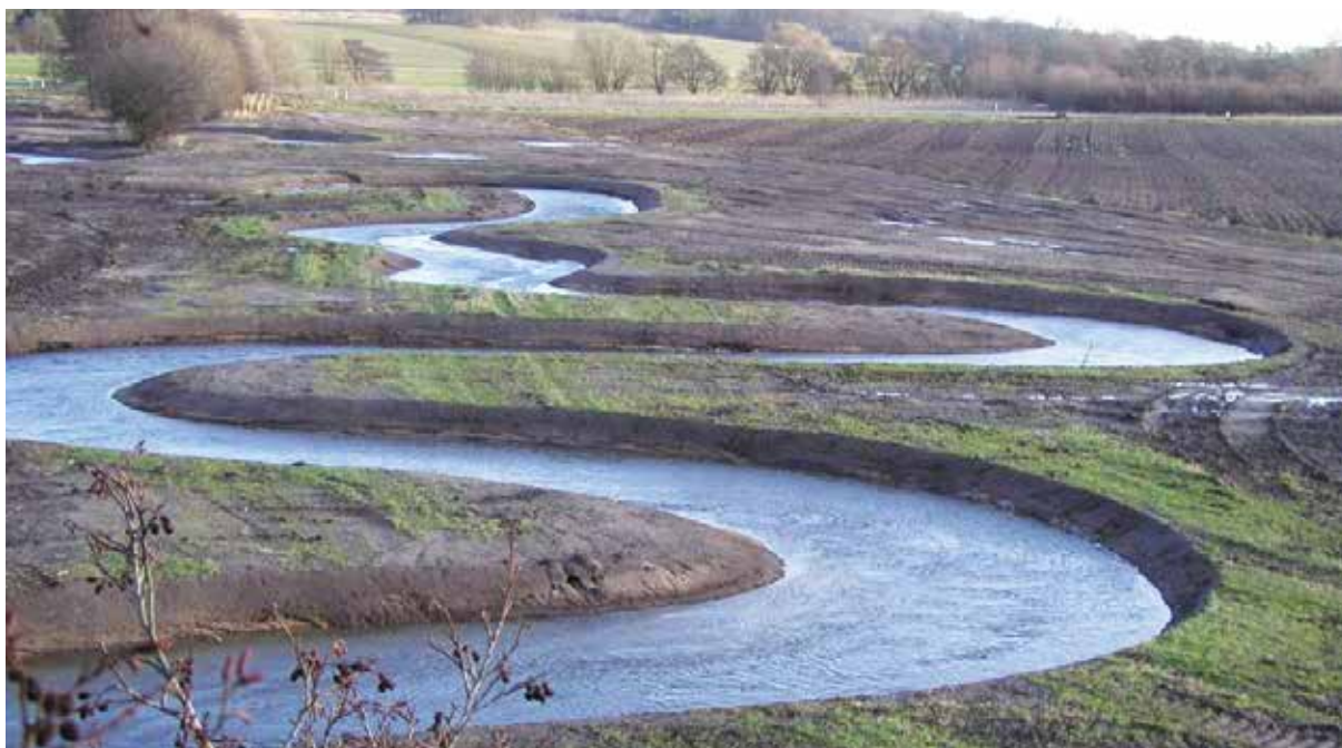
Programme of Measures can i.e include the hydrological conditions in streams such as here, where Fladså river in Denmark is re-meandered.

Financing the efforts needed seems to be a common barrier across the countries, and it is a challenge to align ambitions and resources, so efforts are not wasted on the production of plans without opportunities for realisation in practice. It is common to perceive the EU funding as the main source for financing WFD measures. Especially the Rural Development Programme is central in limiting limit the diffuse pollution from agriculture, and this programme is also increasingly targeting the WFD. Importantly, however, the agri-environmental schemes in this program are mainly voluntary, highlighting the importance of facilitation of a good dialogue with farmers and other stakeholders at local levels - and the resources for this.