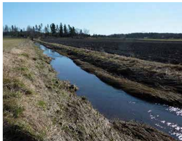
Application of fertilizers near watercourses should be avoided.

Although most of the measures related to fertilizer management are well known and regulated in most Baltic Sea countries, they are not fully implemented and when implemented, it is done in many different ways. This means that there is still much more nutrient reduction potential, both in quantity and in quality, which can be put to use by better implementation.